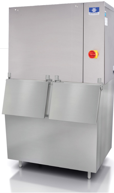
IDT1900W-261V Shown with optional IBW-M5 Marine Ice Bin